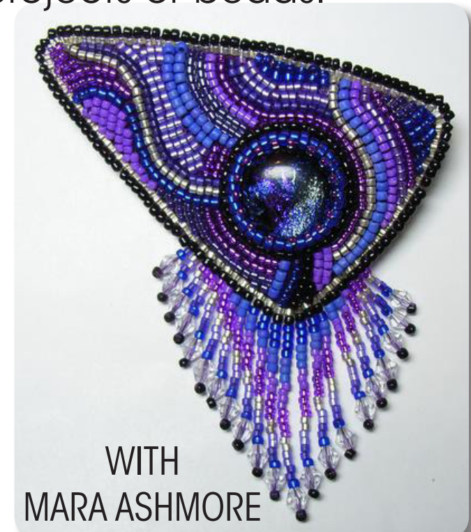
WITH MARA ASHMORE