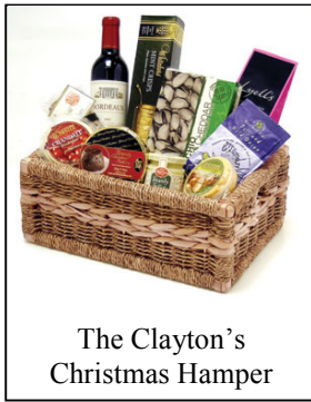
The Clayton's Christmas Hamper