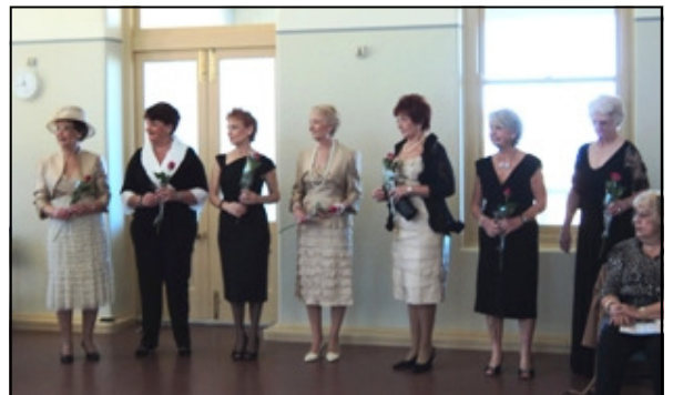
Fashion and front row seats!