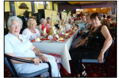
PHOTO: Beading—Winners of Best Decorated Table at EOY Luncheon '10